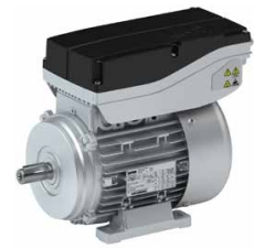
Lenze Smart Motor